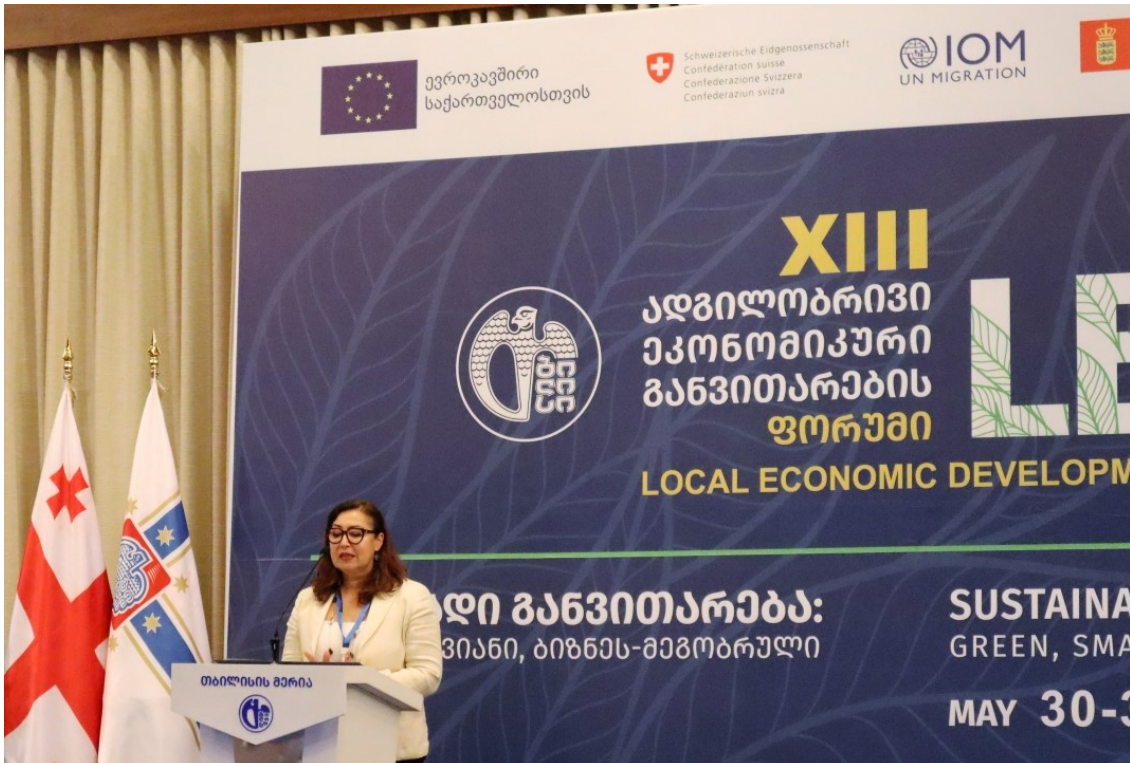
IOM Georgia Participated in 13th LED Forum