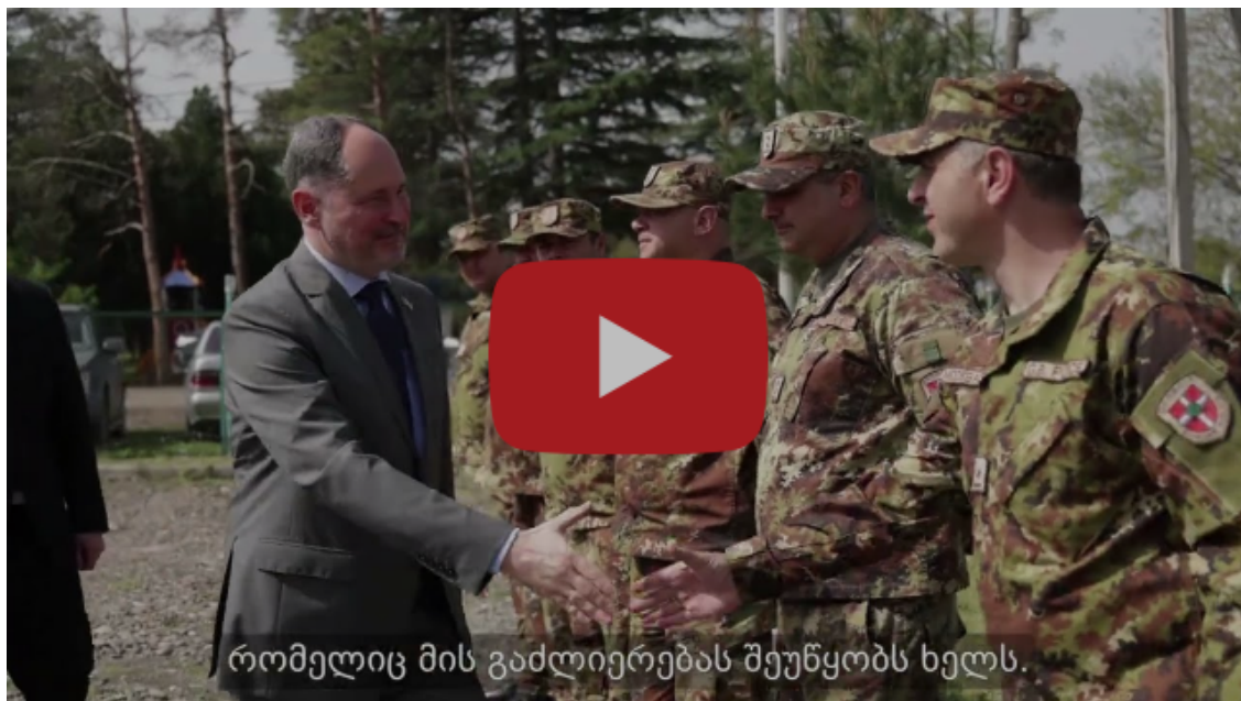
EU and IOM Enhance Georgia's Border Surveillance Capacities.